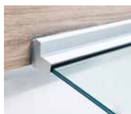
TO WOOD FOR 8/8/4