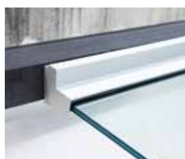
TO CONCRETE + ISOLATION